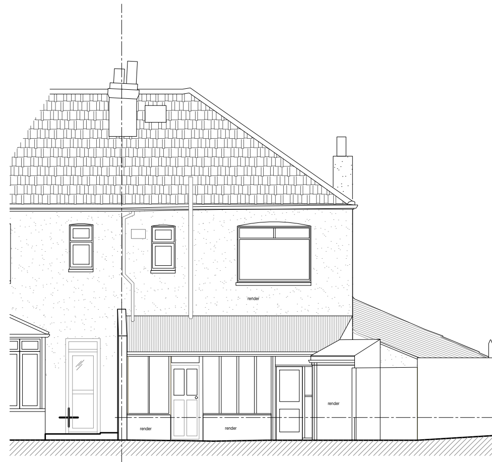
Existing Rear Elevation - 2

T2 Planning Issue 05.11.2025 T1 Planning Issue 13.05.2025 1:1000A3